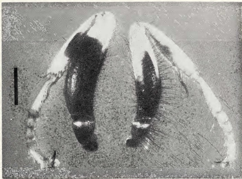
Figure 1. Front legs of a V. austriaca parasite (left) and V. acadica queen (right). The femur of the parasite is thicker and longer than that of the host queen. The black line indicates 1 mm.

The terga and sterna of the gaster of the parasite are more difficult to dissect apart than those of the host. This "tough armature" is often mentioned in regard to vespine parasites. The gastral sclerites appear to overlap very tightly which undoubtedly prevents sting penetration during usurpation attempts. However, the close fitting of the abdominal segments does not appear to be due to a reduction of intersegmental membranes or because of more sclerotization. Instead, V. austriaca has better developed muscles (i.e., larger bundles) in the abdominal sterna and terga than are present in the same segments of a V. acadica queen. For example, the three pairs of intersternal retractors (Duncan 1939) of a fat-laden, fall parasite are about 1.5 times as wide as these same muscles in a fall V. acadica queen. Consequently, this parasite should be able to retract the gastral sclerites more tightly than a host queen.